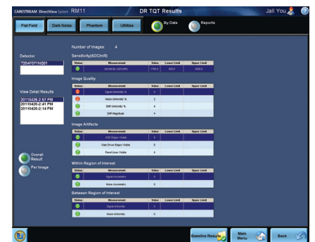
Test results data page displays a summary of the most recent test results for the different cassette sizes and types.